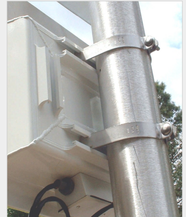
Universal strut and mounting system makes installation on standard size poles or posts easy.