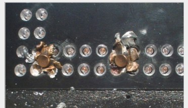
Even 40 caliber bullets fired from point blank range could not penetrate the armored Radarsign Bashplate™ or do massive internal damage to the sign.